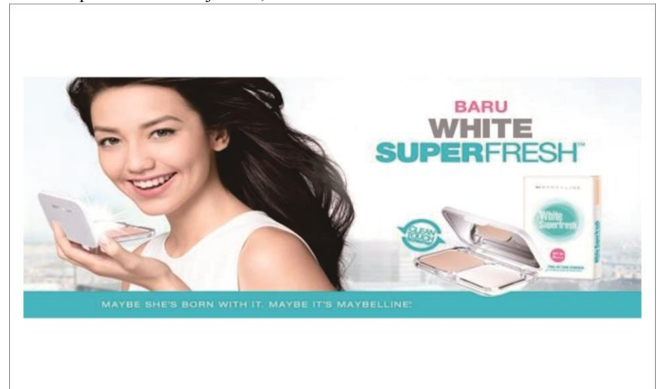
Figure 1. Advertisement on the roadnext to the CITO mall

According to Lakoff (1975), Women do not speak very frequently and they barely use explicit language. It can be distinguished in using the language frequently between the women and men. Commonly, women here, feel so shy if they speak too much. Because from the aspect of feminism, women characteristic are calm and elegant. So, from the calm and the elegant behavior of women influenced the way the communicate each other. There are three samples of data that is presented in this journal;