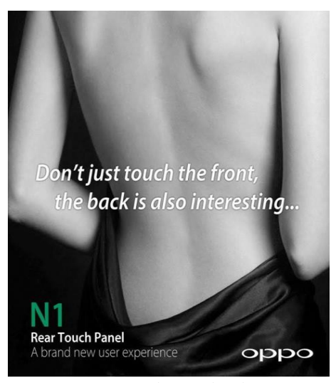
Figure 3. Oppo Phone Advertisement

The picture in this data shows us about one of the jewellery product from one of the best jewellery designer which is Roberto Bravo. In this picture we can see that there is a woman as the international model being the model of the product. In the scene illustrates that the model wear a jewellery in the back neck. The jewellery takes a form as a necklace. And the text is written "EXTRAORDINARY JEWELLERY FOR EXTRAORDINARY WOMAN". In this case, the advertiser tries to send a message concerning the producer's thought about the meaning of using extraordinary jewellery. The advertiser attempts the customers that Roberto Bravo has the extraordinary product. Implicitly, the message is for women out there who feel that they are extraordinary, it is required for them to wear extraordinary jewellery. It is clearly enough to be seen that the advertiser attracts the women customer who wants to buy a high-quality of jewellery to come and to see the collection of Roberto Bravo. And also the advertiser has the intention to make the customers feel amazed to the jewellery. Hopefully by seeing this advertiser, the customers will directly buy this jewellery.