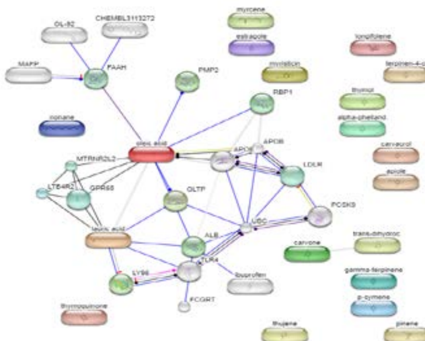
Figure 1. Interactomes of protein and chemical substances including active compounds of Nigella sativa . Color of lines denoted specific types of action, which were activation (green), binding (blue), phenotype (cyan), reaction (black), inhibition (red), catalysis (purple), posttranslational modification (pink), and transcriptional regulation (yellow). End shape of arrow denoted action effects, which were positive (triangle), negative (vertical line), and unspecified (round).