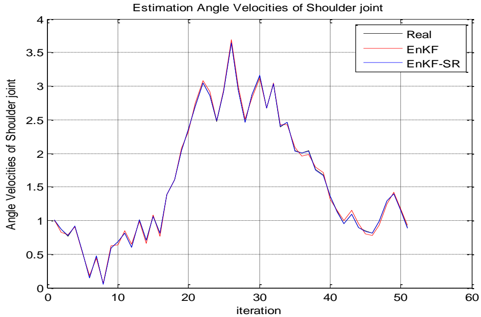
Figure 2. Estimation of Angle Velocities of Shoulder Joint using 300 ensembles