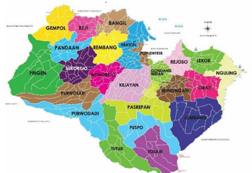
Figure 1. The distribution of 24 districts in Pasuruan

The drinking water stations in Pasuruan Regency's District were selected as the sampling locations. There were 24 districts that included in figure 1 and table 1. The water samples were collected from representative area of Pasuruan's districts. The districts were included Bangil, Beji, Gempol, Gondangwetan, Grati, Kejayan, Kraton, Lekok, Lumbang, Nguling, Pandaan, Pasrepan, Pohjentrek, Prigen, Purwodadi, Purwosari, Puspo, Rejoso, Rembang, Sukorejo, Tosari, Tutur, Winongan, and Wonorejo. Each district had different total of water drinking stations (Table 1). However, only water drinking stations that already commercially distributed in market were choosen for its quality analysis in this study.