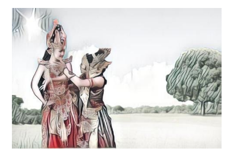
Figure 2. Model of Story Board

The writer can not to state all pictures here. So that to suit with the limited space of conference of proceeding paper, he stated one picture as example below. The pictures are made as interesting as it can. So that students will encourage to write their ideas