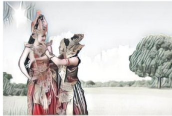
Figure 2. Model of Story Board

The writer can not to state all pictures here. So that to suit with the limited space of conference of proceeding paper, he stated one picture as example below. The pictures are made as interesting as it can. So that students will encourage to write their ideas