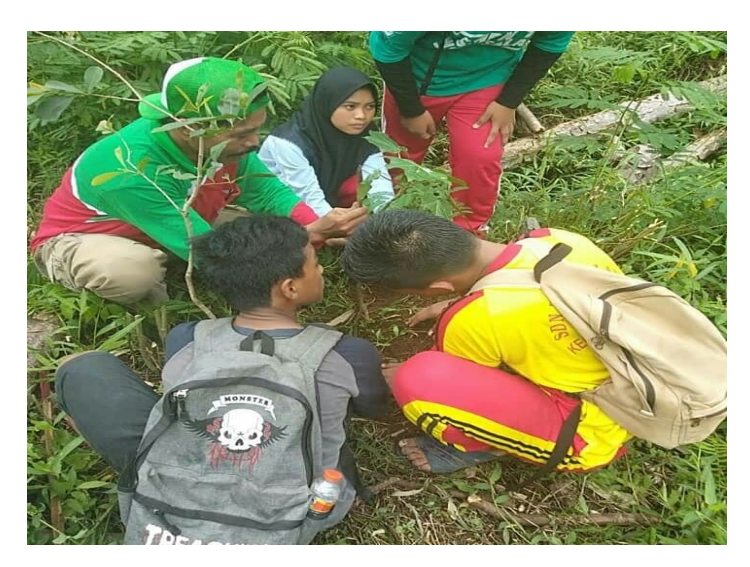
Figure 1. Tree Planting with Students

In caring for the spring, the green youth community also provides an example for the community on how to care for spring water, starting from planting trees around the eyes to cleaning the spring, this is done so that people appreciate more about water used daily and of course can forming a character that cares about the environment, this is in accordance with the opinion of Mas Cokro,