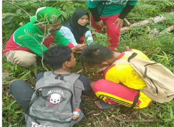
Figure 1. Tree Planting with Students

In caring for the spring, the green youth community also provides an example for the community on how to care for spring water, starting from planting trees around the eyes to cleaning the spring, this is done so that people appreciate more about water used daily and of course can forming a character that cares about the environment, this is in accordance with the opinion of Mas Cokro,