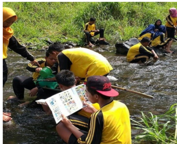
Figure 2. Clearing of Spring Streams

“... If we take care of the spring, we invite the community to clean up at the spring, especially in the area where the spring flows. When the forest is bare we are planting trees followed by the community, if now it's just cleaning, bro ... ”(Primary data source, 13 May 2020)