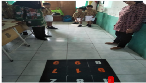
Figure 1. Rubber Throwing Game Rubber

through his research that he has succeeded in developing traditional game-based learning models to improve the gross motoric abilities of light-hearted children.