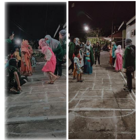
Figure 2. The implementation of "Engklek" in Kalijaten

"Engklek" game is a traditional Indonesian game that is almost extinct, because at this time the game of "engklek" is rarely played by children. This is due to the growing technological factor. Even so, children do not forget how to play this game. So that this game does not become completely extinct, it is necessary to have a few additions and changes in this game to make it even more interesting. Therefore, the researcher applied this game to improve vocabulary in children by adding a flashcard containing vocabulary in each "engklek" case. the way to play remains the same, the difference is that each player must take the flashcard in their gaco box. The flashcard contains questions about Indonesian vocabulary which they have to translate into English. Players must answer the questions on the flashcard. If the player manages to answer then the player cannot continue the game and vice versa if the player cannot answer the question then the player cannot continue the game. With this game can improve the player's English vocabulary. Players can find out new vocabulary that they don't know yet. And players who already know can recall the vocabulary they have memorized.