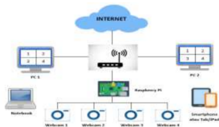
Fig.1 Hardware Architecture

Based on the purpose od this research, design a webcam security system with additionally to detect and recognize motion that implemented on raspberri pi. With the motion detection, the images can saved in sd card and displayed n monitor.