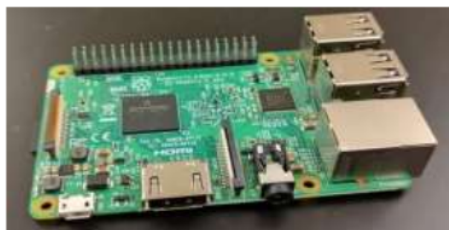
Fig.2 Raspberri Pi

Raspberri Pi is a single-board computer with wireless LAN and Bluetooth connectivity, also small sized computer which using Linux as the operating system. There are 7 operating systems that can be installed on Raspberri Pi. The Raspberri Pi also has an HDMI input, USB port, audio out jack, LAN port, and RAM which is the latest technology at a price that is quite affordable, of course it can change for CCTV cameras that cost more. In addition to costs, data storage is also a thing to consider, the Raspberri Pi can connected to the internet network so that the recorded results are no longer stored on hard disk or memory card but online cloud storage. Raspberri Pi is also capable become a web server, so that connected cameras can be monitored through the website wherever you connect to an internet connection, unlike most CCTVs you have to monitored via TV or monitor. This research use Raspberri Pi 3 model B (Fig. 2) which faster processor and faster connection.