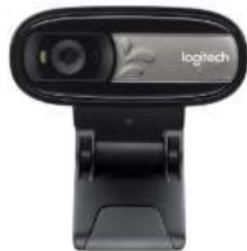
Fig.3 Web camera

features Logitech's Fluid Crystal Technology and the VGA sensor supports video clear video calling at 640 x 480 resolution. C170 can capture video at 1024 x 768 resolution and up to 5-megapixel photos with a little help from the Logitech software. There's a built-in microphone with noise reduction, so you can clearly hear who you are talking with. The webcam includes a universal clip that can attach to your laptop or desktop monitor.