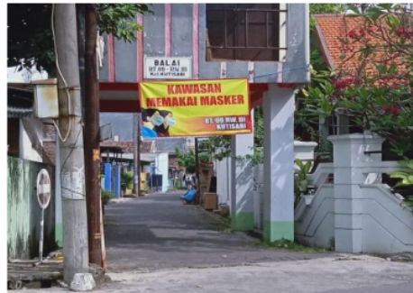
Picture 2 Territory of RT 09 RW 03 Alley 7