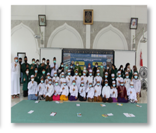
Figure 1. Youth nutrition health socialization activities

Evaluation of socialization results in the form of pre-test and post-test, there are ten questions given to students to be filled before and after the oral presentation. The results of the evaluation are described in Table 3.