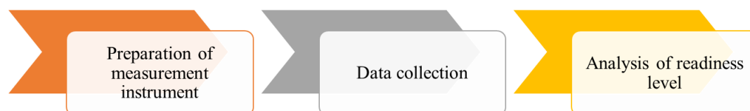
Fig. 1 Research Methodology

The method used in the readiness analysis is the descriptive research method with quantitative and qualitative approach. By definition, this study seeks to describe the readiness of universities in implementing online learning. To achieve the objectives, this research was carried out in three main stages (see Fig 1). First is the preparation of measurement instruments. The second is data collection. The last is an analysis of the level of readiness for online learning.