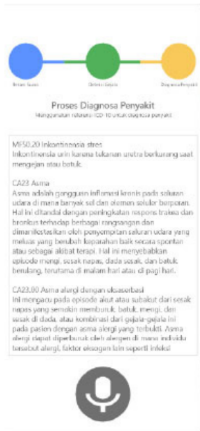
Figure 4. Result Interface.

stopwords removal, and NER. after that, all that symptoms related to the digestive diseases system are shown.