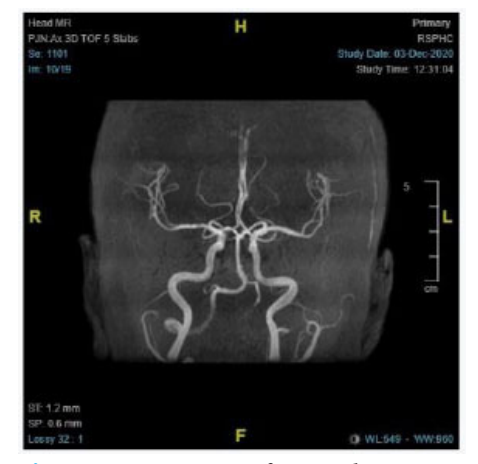
Figure 1. Overview of Normal MRA.

In accordance with the results above, most patients at PHC Surabaya Hospital were in the age category of 40 years or more (92.3%) with the average age of the patients was 56.96 years \pm 14.05. The youngest patient