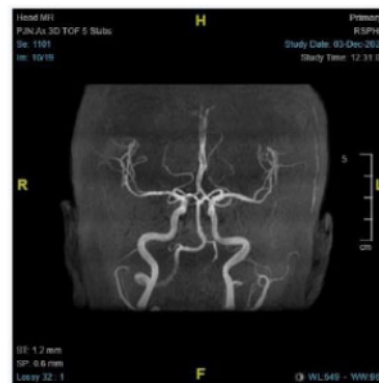
Figure 1. Overview of Normal MRA.

In accordance with the results above, most patients at PHC Surabaya Hospital were in the age category of 40 years or more (92.3%) with the average age of the patients was 56.96 years ± 14.05. The youngest patient